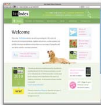
Example of web site screen shot

Add a black and white photo at no extra cost or a colour photo (or web site screen shot) for just £25 + VAT* (*free if you already have a colour logo)