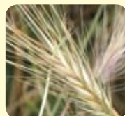
Grass awns of the summer grasses