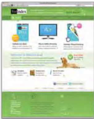
Example of a web site screen shot

Additionally, why not consider adding some colour photos (or web site screen shot) for just £25 + VAT* (*free if you already have a colour logo)