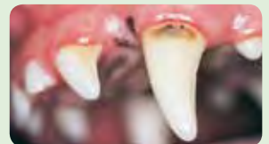
(2) Gingivitis – with early calculus