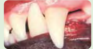
(1) Healthy mouth