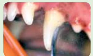
Removing the calculus using an ultrasonic scaler, followed by polishing the teeth is a very effective form of treatment